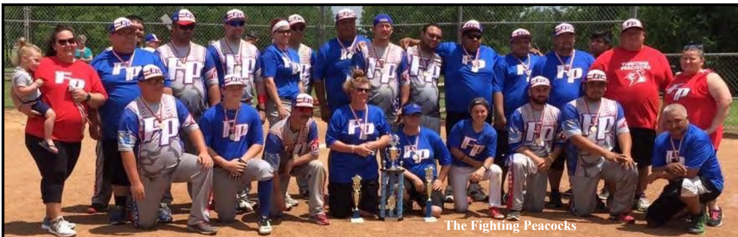
The Fighting Peacocks

Find us on Facebook at www.facebook.com/HomeofHopeOK , visit our website at www.homeofhope.com , or just call us at (918) 256-7825, ext. 152 to schedule a visit to our main campus.