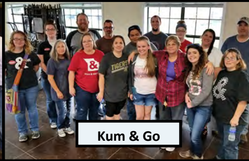
Kum & Go