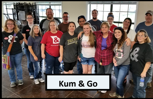
Kum & Go